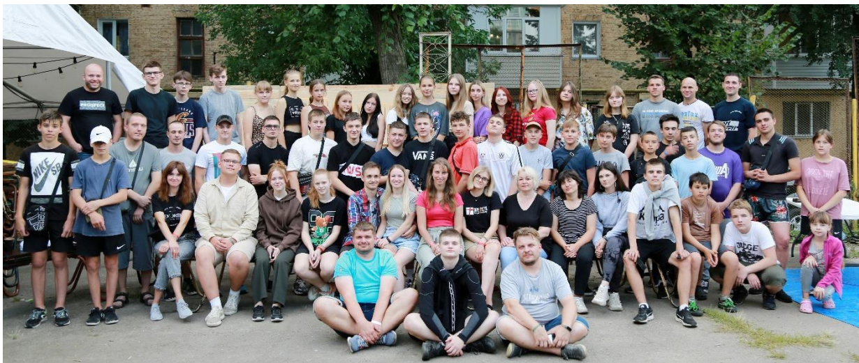
Teen Camp - July 10-14, 2023

In addition to the children's Day Camp, we held a camp for teenagers and young adults (ages 13 and older) in the evenings. This camp lasted from 5 p.m. to 9 p.m. It usually started with popcorn, cotton candy and games, and then there was tea, coffee and a snack.