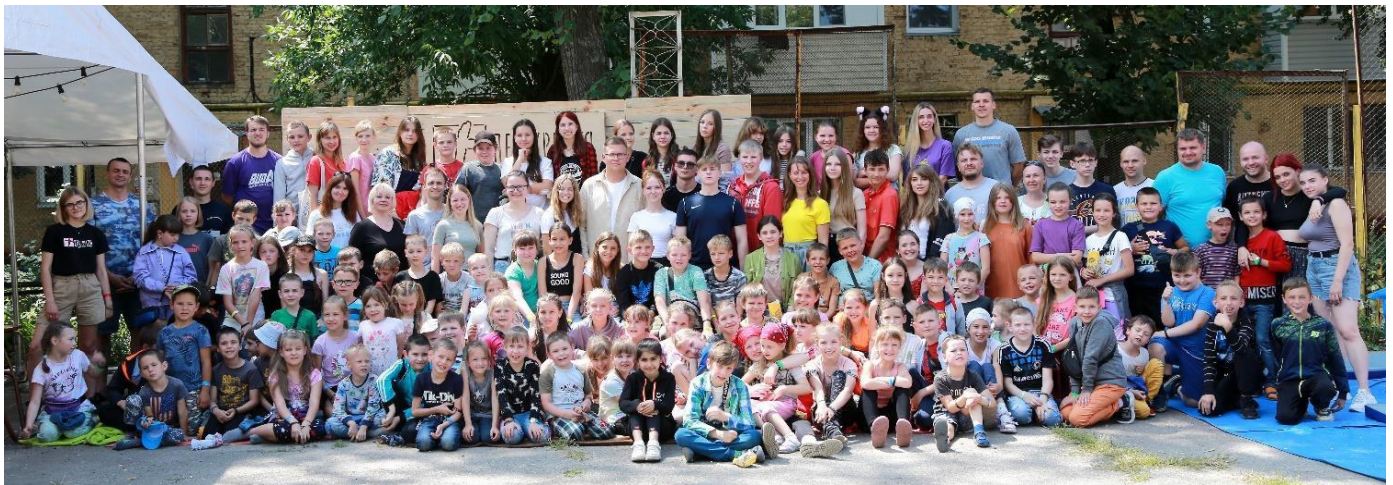
Day Camp I - July 10-14, 2023

One group went to crafts, the second - to Bible lesson, the third - to games and snacks activity (inflatable slide, trampoline, table tennis, popcorn, cotton candy) and the fourth - stayed in a large tent, where they took part in various competitions and learned Christian songs. Every 50 minutes the children moved from one location to another. Thus, all children could visit each location. After attending all activities, children gathered for a general meeting (20 minutes), where the results of the day were summed up and the necessary announcements were made. At the end of the day's program, children went to their homes.