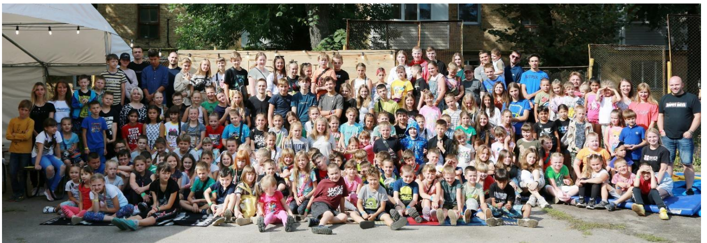
Day Camp II - August 7-11, 2023