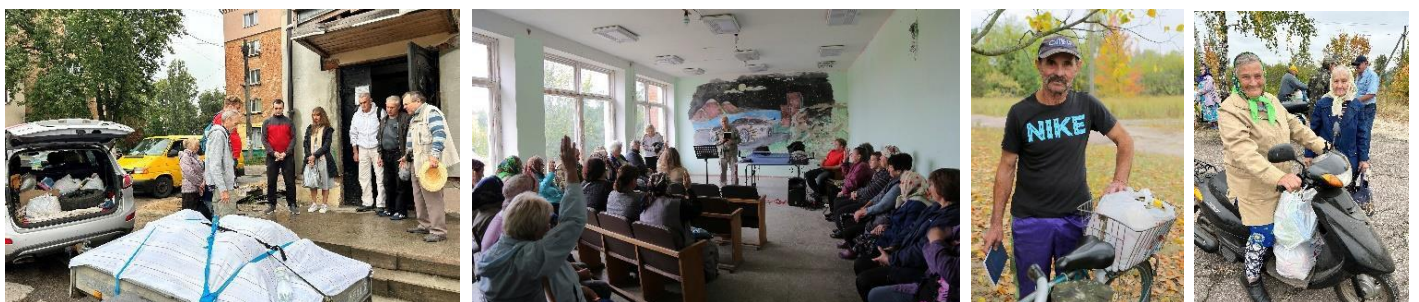
Radul' village, Chernihiv Region / September 15, 2023

Almost at the border: In September 2023 we visited a number of villages which are located 3-4 km from the border with Belarus. These villages were not occupied, but they had a lack of groceries and other goods because nothing could be delivered to them. The occupant's army was between those villages and Chernihiv city.