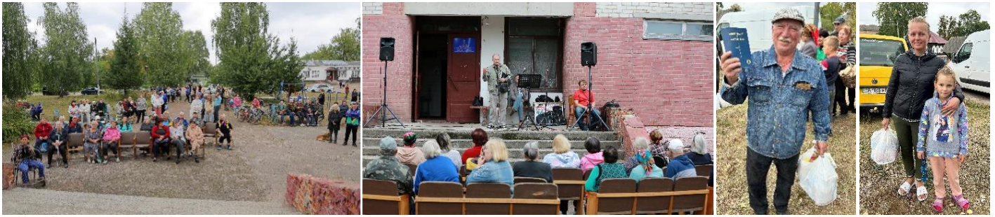
Lopatni village, Chernihiv Region / September 15, 2023

Due to their location volunteers very rarely deliver the aid there. As local inhabitants witnessed, last time they received humanitarian help in May.