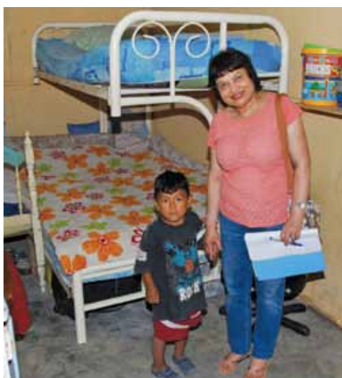
Inside these little homes basic furniture such as beds, chairs and a table as well as kitchen equipment is included in that £2,000.00.