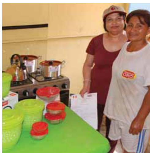
Simple cooking stoves and storage jars are also provided to set up a family and give them a 'Leg Up' and the opportunity they need to build a better future.

This house stands on a secure concrete base and is constructed with plywood walls with a corrugated iron roof. One Christian school in Doha in the Gulf has provided help to several needy families who now live in secure accommodation, at a cost of £2,000.00 each.