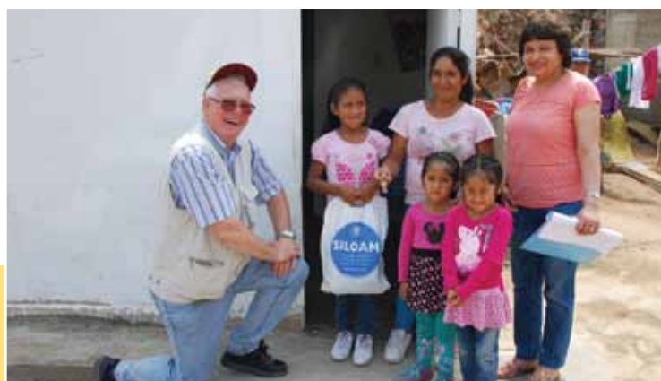
It is indeed humbling to meet these families and witness their great need but by helping them in this practical way, we can spread God's love to folk who never thought anyone cared about them in another part of the world.