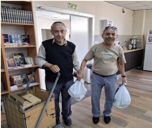
Picking up desperately needed food packages in Sderot.

By the time you receive this brief newsletter, Siloam will have forwarded another £1,500 to 'Love to the Needy' to cover the donations we have received during May and June. We will endeavour to keep this channel open so that our supporters and occasional giving friends can continue to use Siloam as a channel of help to 'Love to the Needy' in Israel who provide day-to-day practical assistance to desperately needy people as a vehicle for the Christian gospel in Israel.