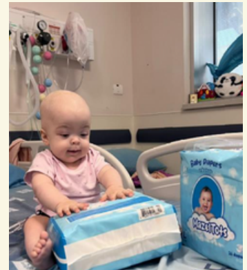
Nappies for families in dire need.

Back in May also because of another generous donor, 'Love to the Needy' were also able to distribute 600 children's plush pillows. What delight it must have brought to these children who are not accustomed to such luxury items, to receive a new toy to cuddle and sleep with.