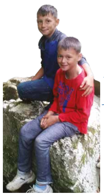
Most of the children came from the two residential homes run by P.R.R although others were invited to join the group who came from poor homes.