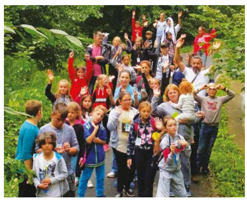
The camp we sponsored last year near Brasov provided a Christian holiday for 44 children between 8 and 16 years of age.