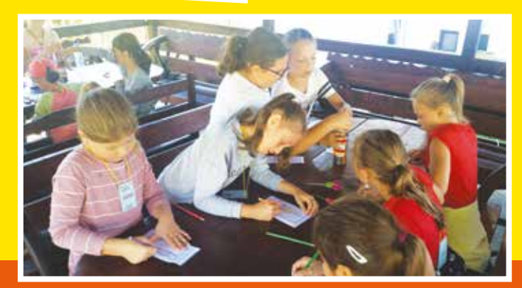
Divided into 3 groups who went in turns to 4 different stations where staff would lead them in challenging activities.