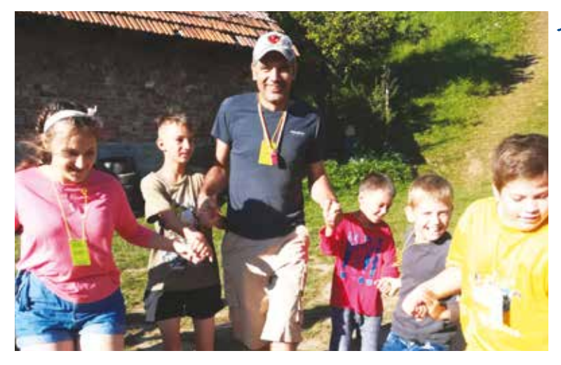
The 44 children were looked after by 8 adults who together became good friends enjoying the wonderful activities P.R.R were able to organise.

Yours sincerely on behalf of the youngsters we are trying to reach with the gospel of Jesus Christ