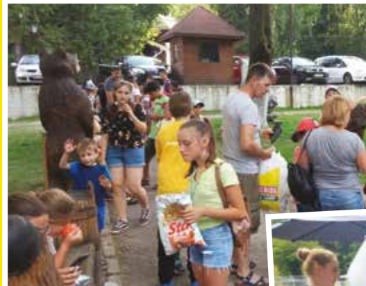
Keeping hungry children happy and providing nourishing treats until the next mealtime.

Jaking children away from their regular mundane surroundings and exposing them to places of interest that would not normally be accessible to them, helps to expand their minds and provide an opportunity to broaden their interests.