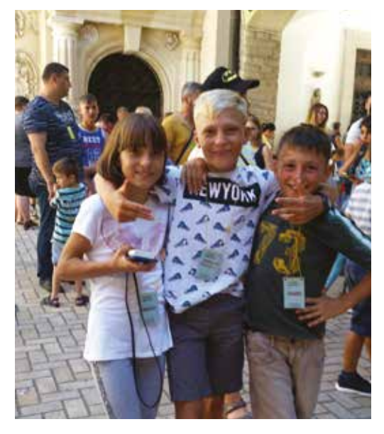
The children were given the opportunity to visit areas in and around Brasov that tourists normally enjoy and that our children may not have previously had the opportunity of visiting.