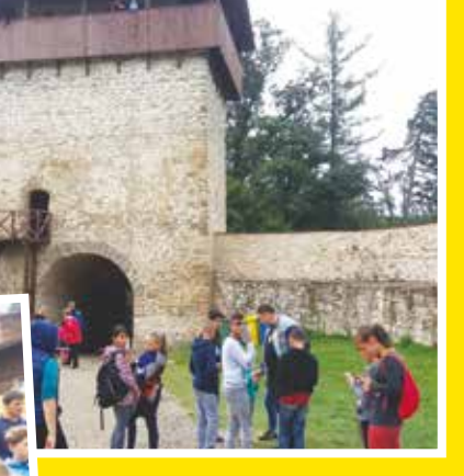
Please send your prayerful investment for our August camp by 30<sup>th</sup> June 2020 thank you.